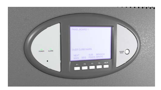
LDMF Monitoring Screen