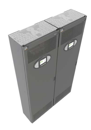
Double, 1'x4', 168pole, 2x400A