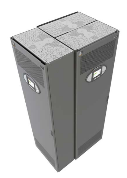
Triple, 2'x3', 252pole, 3x400A