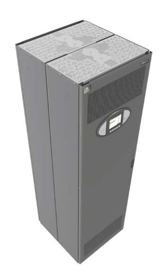
Double, 2'x2', 168pole, 2x400A