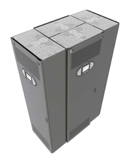
Quadruple, 2'x4', 336pole, 4x400A