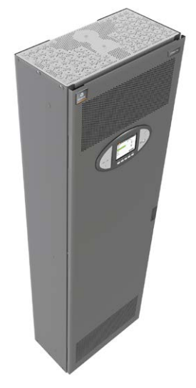
Single, 1'x2', 84pole, 400A

The flexible Liebert RX is easily configured to accommodate current site needs and future growth.