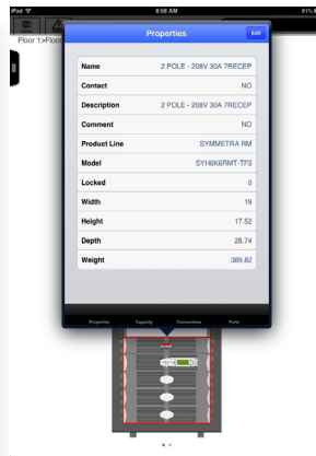
Trellis™: Mobile Suite image properties