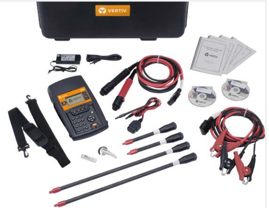
(Shown with optional accessories)