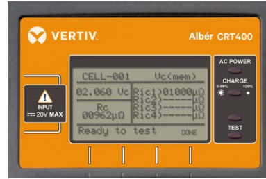
The test screen show the cell number, internal resistance, voltage and four intercell connections.