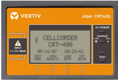
The new graphical display makes it easier to navigate through the menus.